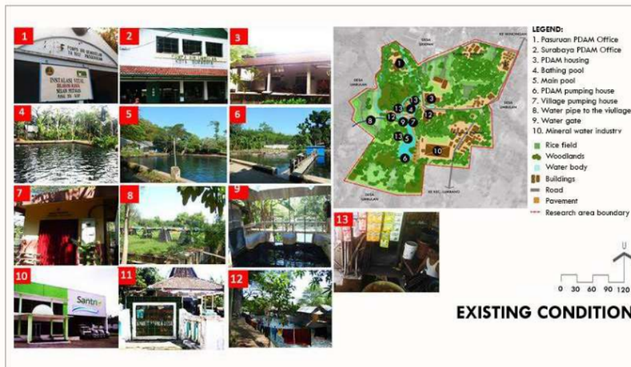
Figure 2. The site existing condition

The site of UWS is part of Rejoso Watershed ecosystem. The average water discharge of UWS was 5,000 l/s in the 1990s. The water was used for piped water in Pasuruan regency, Pasuruan and Surabaya cities, irrigation, fishery, and water supply for Umbulan villagers.[9] The observation in 2015, however, showed that the water discharge decreased into 3400-4000 l/s. The decrease was triggered by the land conversion from forest to agricultural land, and the increasing critical land upstream from Umbulan until the slope of Bromo Mountain. Overused of underground water for the industry at the spring, the increasing illegal drilling, and the growth of population followed by settlement expansion were apparently contributed to the decreasing landscape quality of UWS.[10][11]