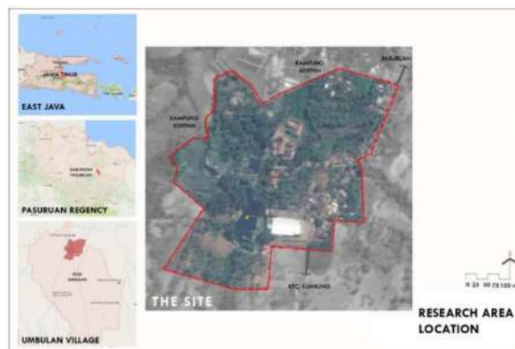
Figure 1. Location of the research area

The research was conducted in the Umbulan Water Spring, Umbulan village, Winangun district, Pasuruan regency, East Java (Fig. 1). It was carried out from August 2016 to March 2017. The research activities consisted of preparation, collecting primary and secondary data through site observation, interview and literature study; analysis of physical elements and perception; and synthesis to formulate the users-site interaction particularly in the context of the space use, the landscape meaning, and the impact on the site.