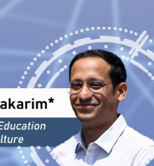
Nadiem Makarim* Minister of Education and Culture