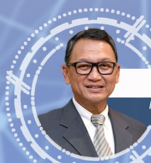
Arifin Tasrif* Minister of Energy and Mineral Resources