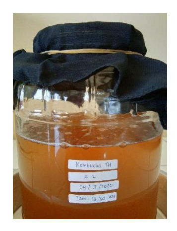
Figure 1. Production of Green Tea Leaf Kombucha

According to the journal (Wistiana, 2015) and (Indriyani, 2018) the amount of yeast and lactic acid bacteria increased on the 14th day, the total phenol content increased on the 14th day, and the total content of gluconic acid and other organic acids increased from day 14th day -6 and decreased on the 30th day. So it can be said that the effective duration of green tea leaf kombucha fermentation to obtain antibacterial activity like that causes acne like Propionibacterium acnes and Staphylococcus aureus is 14 days.