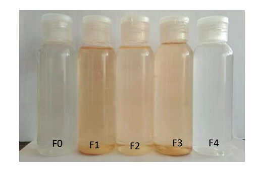
Figure 3. Results of Green Tea Leaf Kombucha Face Toner

The results of the green tea leaf kombucha toner formulation (Table I) by adding the main ingredient to the concentration obtained from the results of the antibacterial activity test of green tea leaf kombucha solution showed the best ability to inhibit acne-causing bacteria and slightly sour scent.